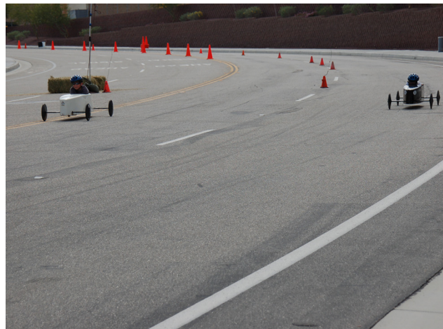
Looking up from the finish line.

Street closure is 1,250ft. Track length is approximately 815ft.