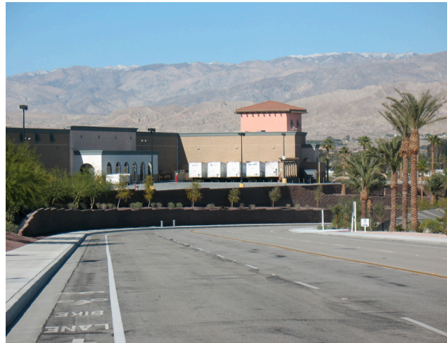
Looking down from the starting ramps.